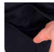
Cargo pocket with Velcro closure