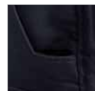
Special U-shaped pocket for knife