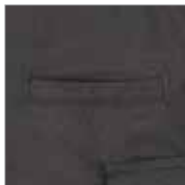
Two 4 inch front welt pockets