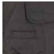
Two rear knife/flashlight pockets