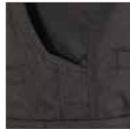
Reinforced pocket knife corners