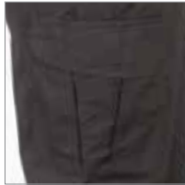
Innovative cargo pocket design