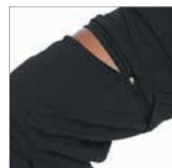
Zip-off legs converts into shorts