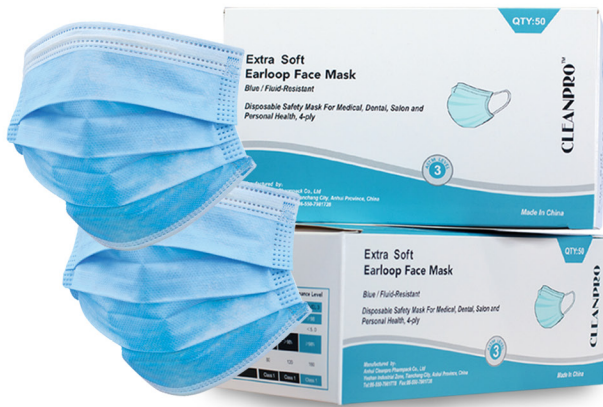
Medical Face Mask Material Requirements by Performance Levels